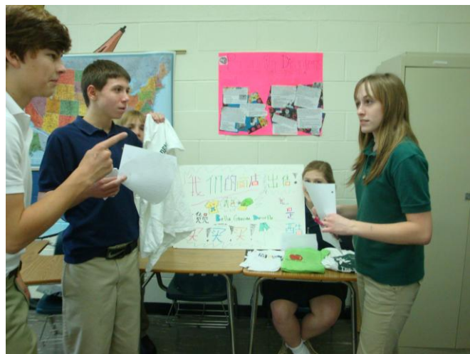
Mandarin students learn how to buy and sell in a Chinese marketplace

in Chinese currency using the internet, and then decided for how much they could sell the clothing after understanding the bargaining culture of a Chinese marketplace. The classroom was turned into a simulated Chinese market with Chinese currency. Students then learned how to buy and sell clothing using bargaining strategies. Students are following the simulation by writing dialogues in Chinese about how the successful deals were made and why some deals were unsuccessful.