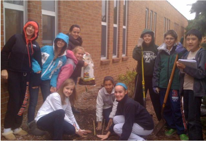
NDMA students planting a butterfly waystation at Notre Dame

An application was sent to monarchwatch.org in order that we might to be a certified waystation. We received word that we are a certified site and are currently awaiting certification documents and signage. Watch for the date of our inauguration ceremony!