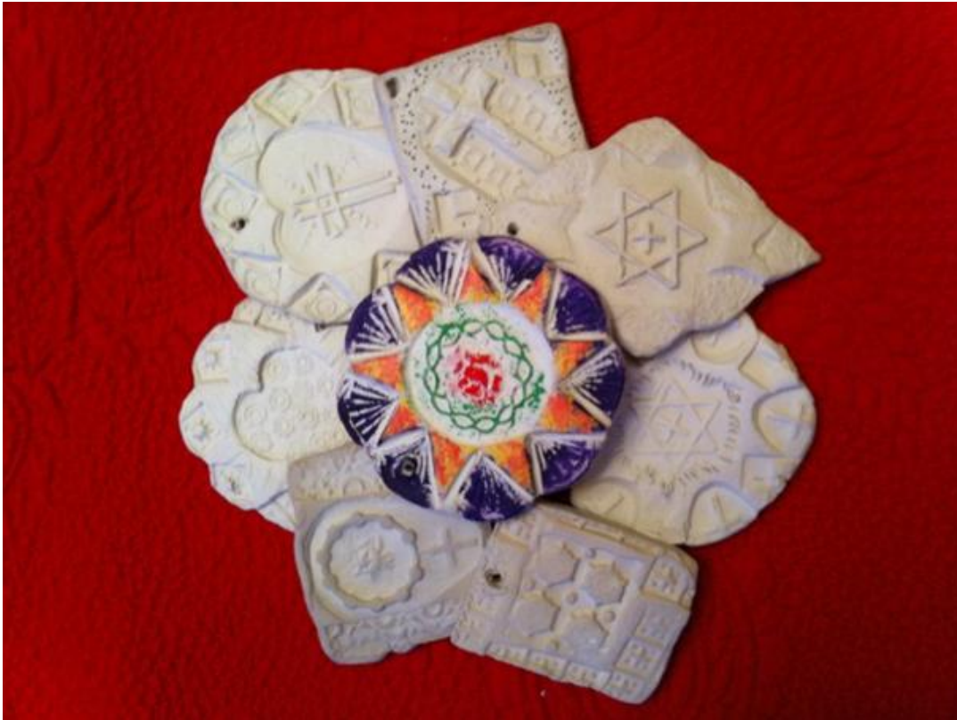
Clay medallions created by 7 th grade students at the Subiaco Retreat House

“I love the students, lunch and intramurals. The students are funny and friendly, the lunch is delicious, and the intramurals are super fun.”